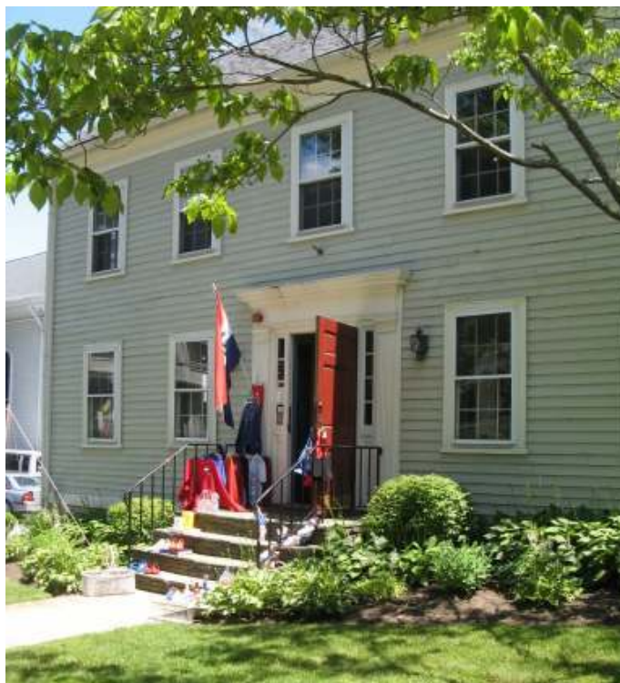
St. Michael's Thrift Shop at the Davenport House, 20 Pleasant St.

Among the shoppers that drift in and out during the afternoon are familiar faces who come frequently to check for 'new' clothing and wares: a retired professor and his wife come often from Danvers, weekly one woman picks out a few greeting cards to send to friends, a family from New Jersey visits local relatives every Halloween and checks out the Thrift Shop, a summer resident selects a jigsaw puzzle or book and donates another, gardeners pick up a vase for flowers to bring as a hostess gift, locals add to their wardrobes and pick up gifts for young relatives who will be visiting. And then there are tourists stopping in for a bargain, a jogger who finds men's clothing, and young people picking up kitchen and house wares for their first apartment. It's not long before you are getting to know new friends and being surprised by visits by others you know. Shoppers are always greeted with a smile and thanked as they leave.