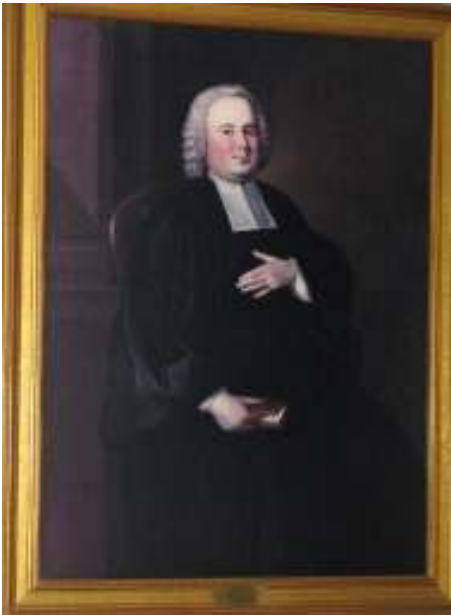
Peter Bours, 1756, from St. Michael's photo-reproduction of the oil painting by Joseph Blackburn. The original was given to Harvard College by Miss Eunice Hooper in 1892.

The following article was adapted from a sermon delivered by Father Stoessel on September 19, 2010.